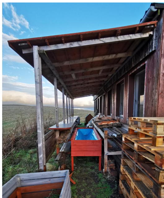
Our new external lean-to and storage area: in progress (left) and the finished article (right)