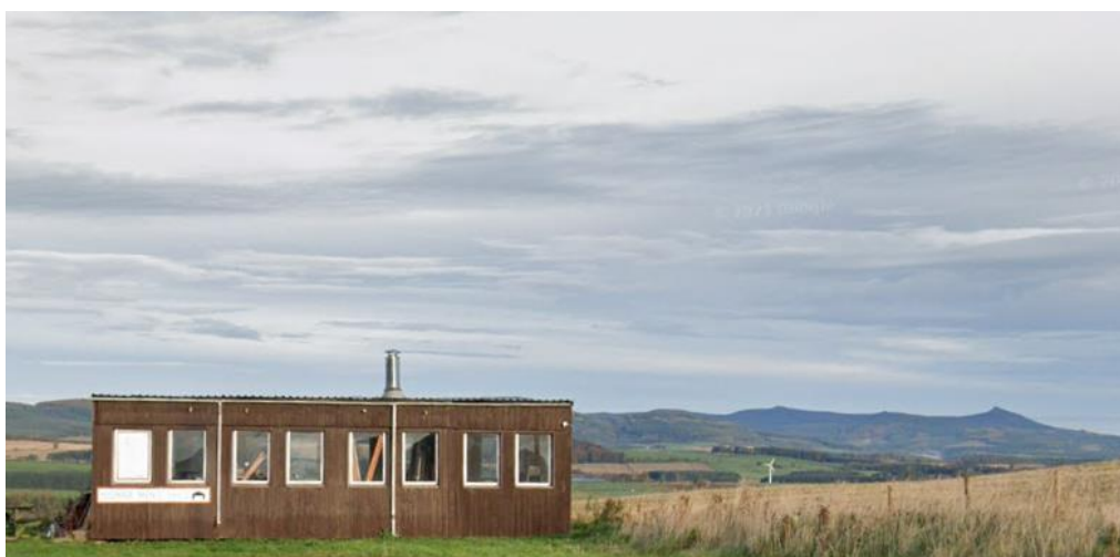
The Midmar Men's Shed, with local landmark hill Bennachie in the background.