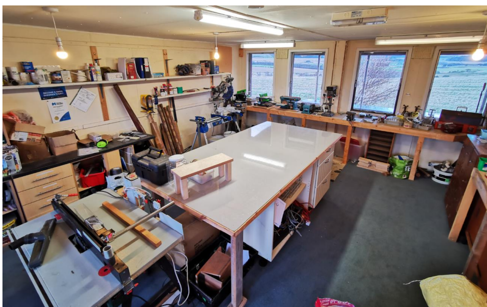
Our Shed's workshop area: the key place for most of our jobs and activities