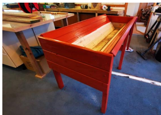
Two of our larger requests this year; raised plant beds for the local school (left), and a raised planter (right)